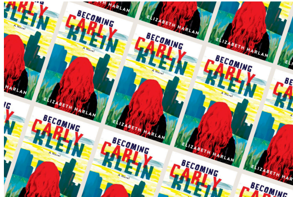
Becoming Carly Klein , a new novel by Elizabeth Harlan '87 , is being published by Spark Press in September 2024.