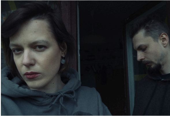
Rule of Two Walls , a visceral portrait of today's Ukraine through the lens of its artists directed by David Gutnik '12 , was released in theaters.